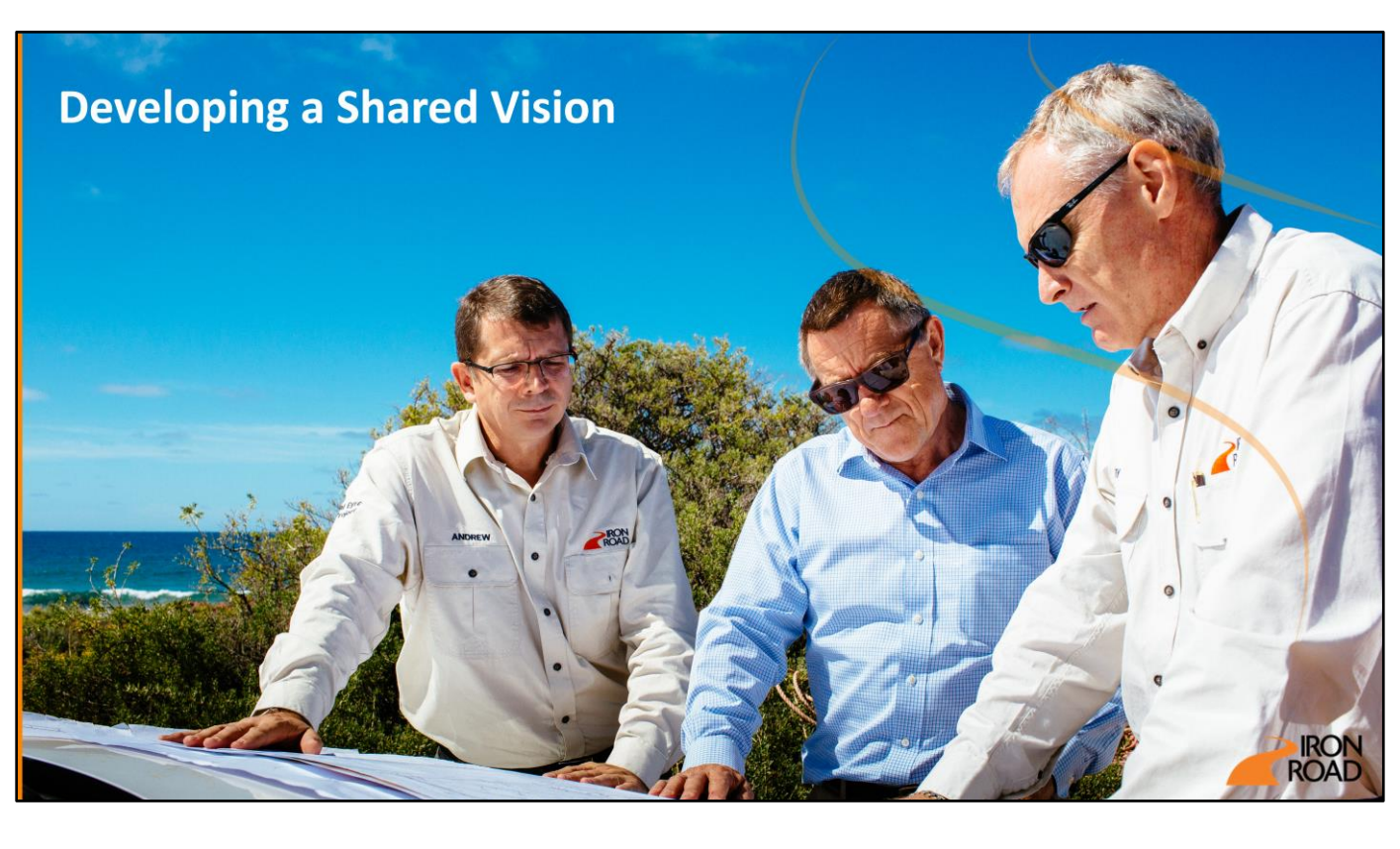
Image – Iron Road and Sumitomo subsidiary, Emerald Grain at the location of the proposed port location at Cape Hardy, South Australia.

Iron Road and Emerald Grain are jointly assessing opportunities to utilise the rail and port infrastructure – it introduces choice for local grain producers