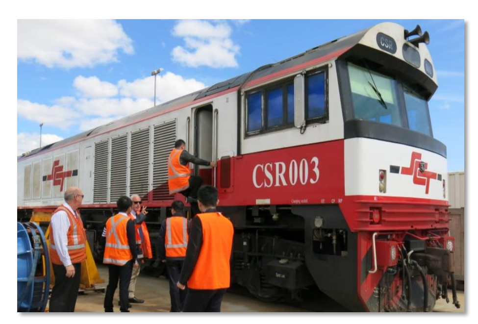
Iron Road and CREC visit to SCT Logistics, Penfield Freight Centre, Adelaide